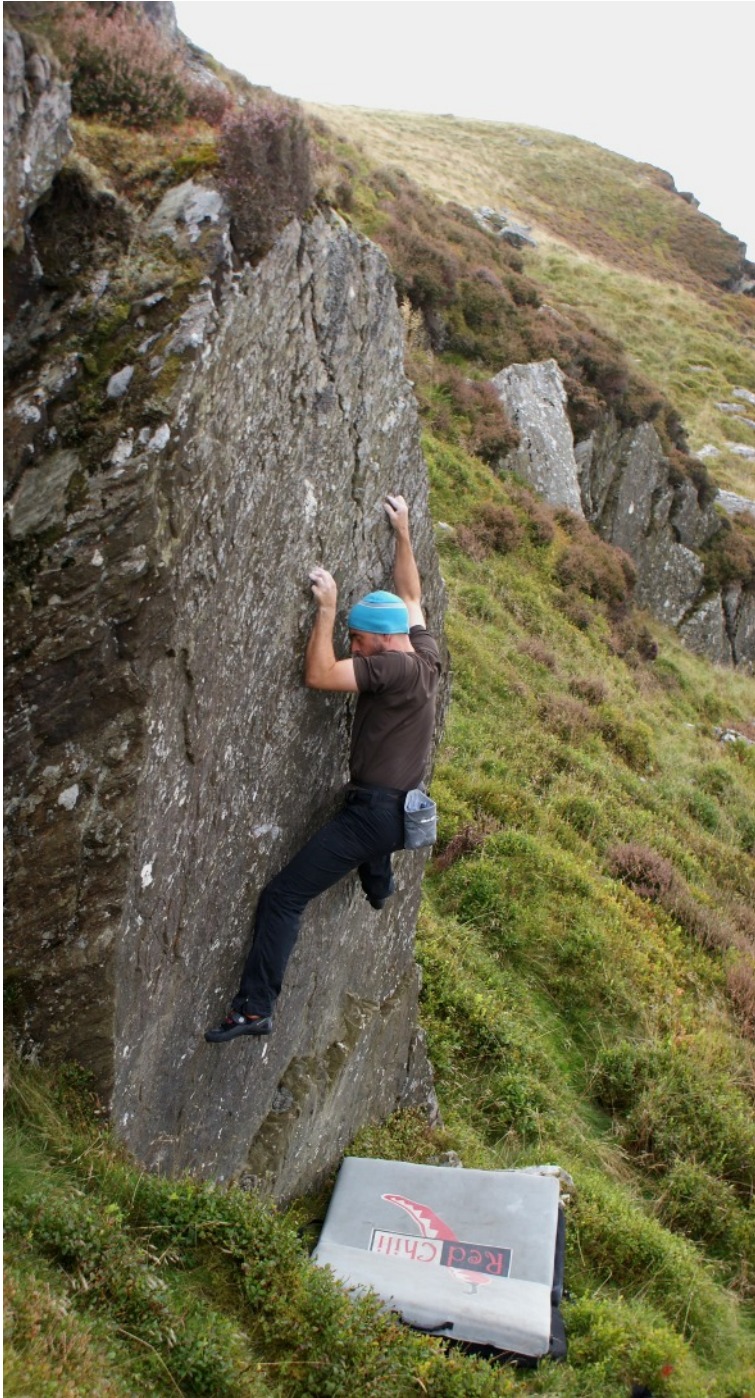
Two views of Perfect Wall